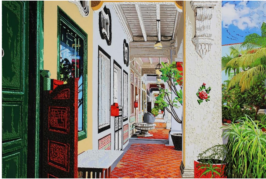
Five-foot way at Blair Road

IF YOU ARE AN ART STUDENT or art enthusiast you must visit the online Art Gallery of Nathalie Laoué . Not only does she display and sell her visual works here, she also goes into detail about medium, technique, culture. What is Giclee Print? What type of paper works best?