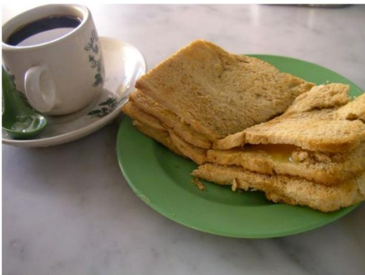
Kaya toast with kopi does the trick during morning break

As I wander through streets and alleys around the neighbourhood in search of inspiration, my favourite moment in the morning is to take a break, and have kaya toast with kopi at the