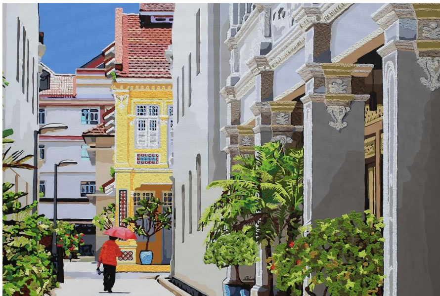
A Walk along Tembeling Road in the East Coast

Singapore, Visual Art – French expat NATHALIE LAOUÉ creates beautiful visual art of these vernacular buildings