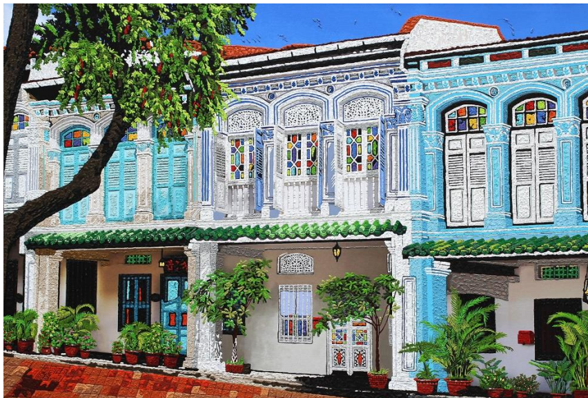
Baroque shophouse at Emerald Hill