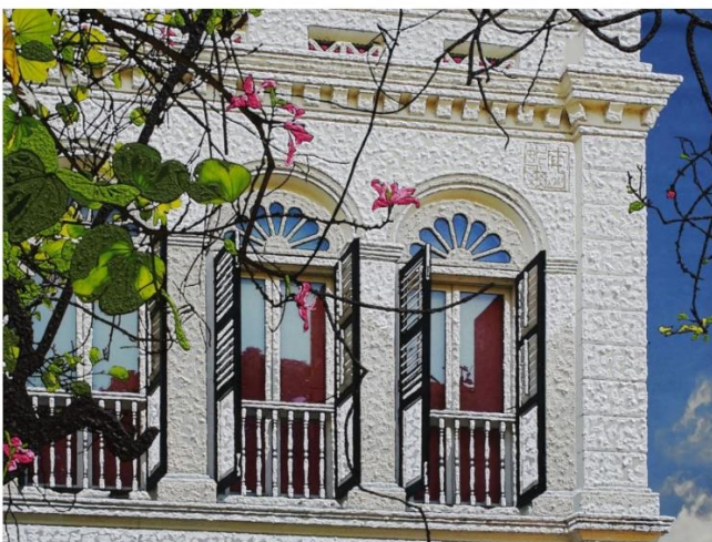
Baroque windows at Duxton Hill